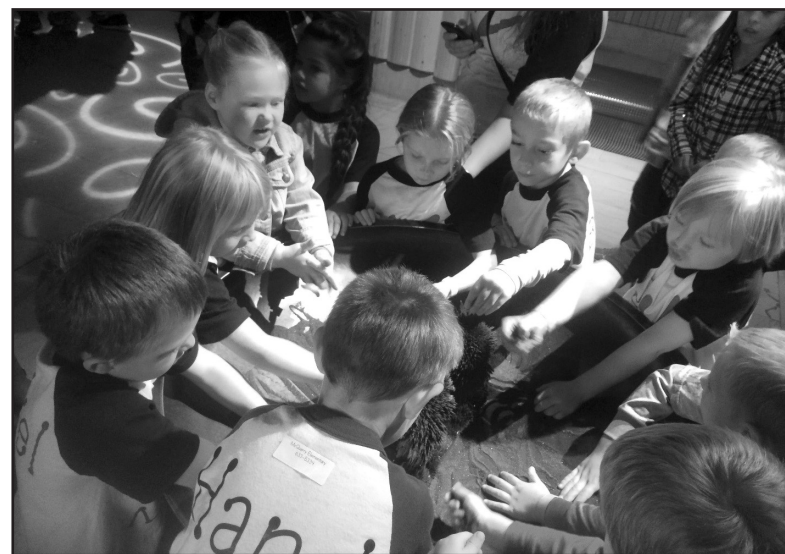
McQuerry kindergartners participate in hands-on exhibits during their Science City field trip.