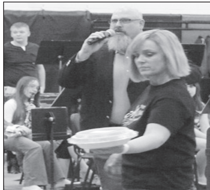
"Going once, going twice... sold in support of the band!"; Odessa Band Boosters held the annual pageant of the bands fundraiser on March 15 in the OHS gym earning over $4000.